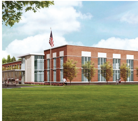
MSU - SOCSD Partnership School Grades 6 - 7 Opening Fall 2020

Overstreet Elementary School Grade 5 Enrollment: 350